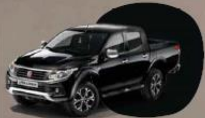
555 Mica Black