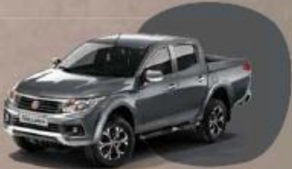
480 Titanio Grey