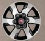
16" alloy wheel