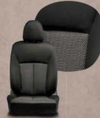
Dark gray fabric with black details