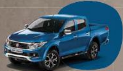
463 Impulse Blue