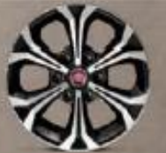
17" alloy wheel