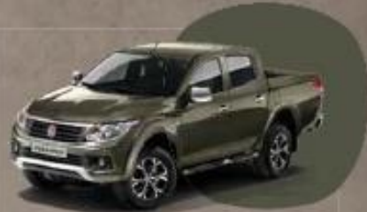
462 Earth Green