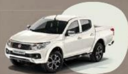
557 Perla White